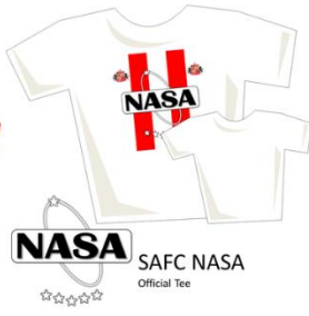
NASA SAFC NASA Official Tee