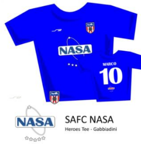
NASA SAFC NASA Heroes Tee - Gabbiadini