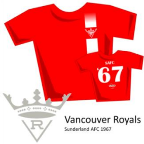
Vancouver Royals Sunderland AFC 1967