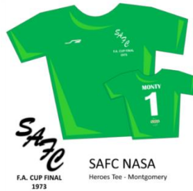
SAFC SAFC NASA F.A. CUP FINAL 1973 Heroes Tee - Montgomery