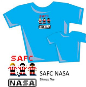
SAFC SAFC NASA Bitmap Tee