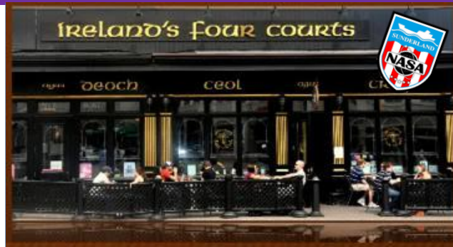
Host of the 2016/17 AGM – Cracking Beer & Bait!

DC more than meets the necessary criteria as set out by NASA's committee for hosting the AGM. So, factoring in accessibility (very easy to get to and around), that DC United hosts Chicago Fire that very weekend, and in Ireland's Four Courts we have both a wonderful host venue and superb supporters, this is expected to be a one to remember!