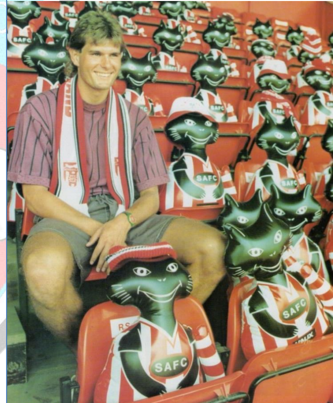
Sporting the mullet! Photo op in Roker Park's Main Stand

Unfortunately, his career was cut short due to injury.