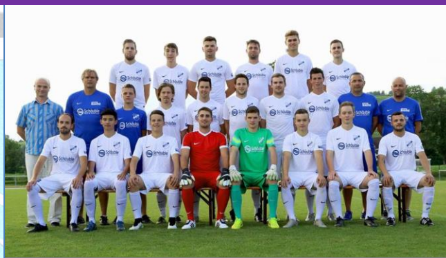
TuS Efringen-Kirchen First Team

For the last five years, I have ran a company which is building up a chain of pump stations