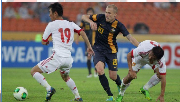
Aaron Mooy (Center) in action for the Socceroos

We do meet, however not as much as we would like, it is difficult given the time slots, most kick off times are 2AM, so it can be challenging in that aspect.